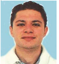
Vlado Andonovski Sector of Foreign Affairs, The President's Office CPPM